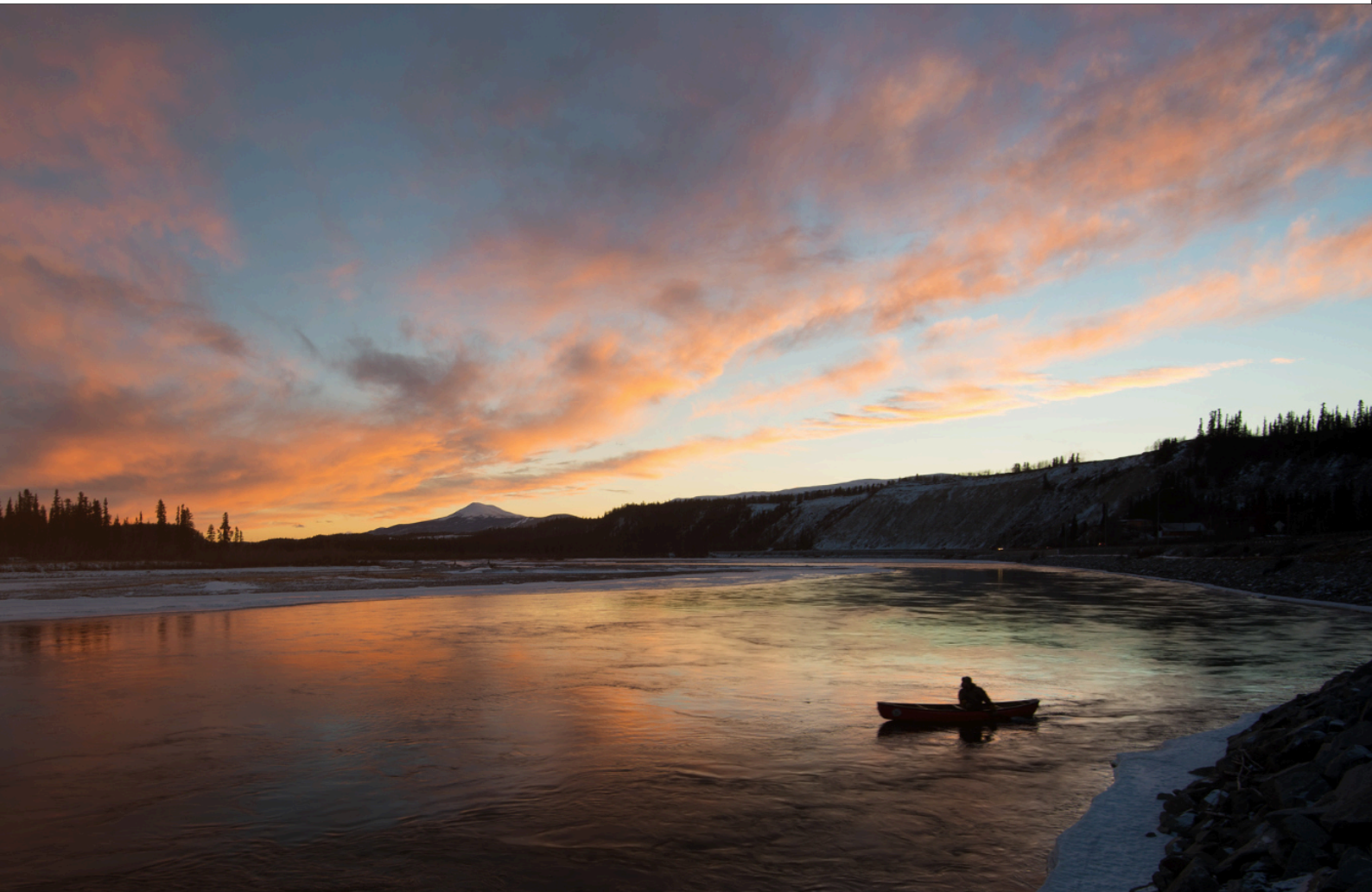
Yukon River.