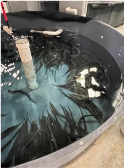
Holding tank at Bonneville Dam.