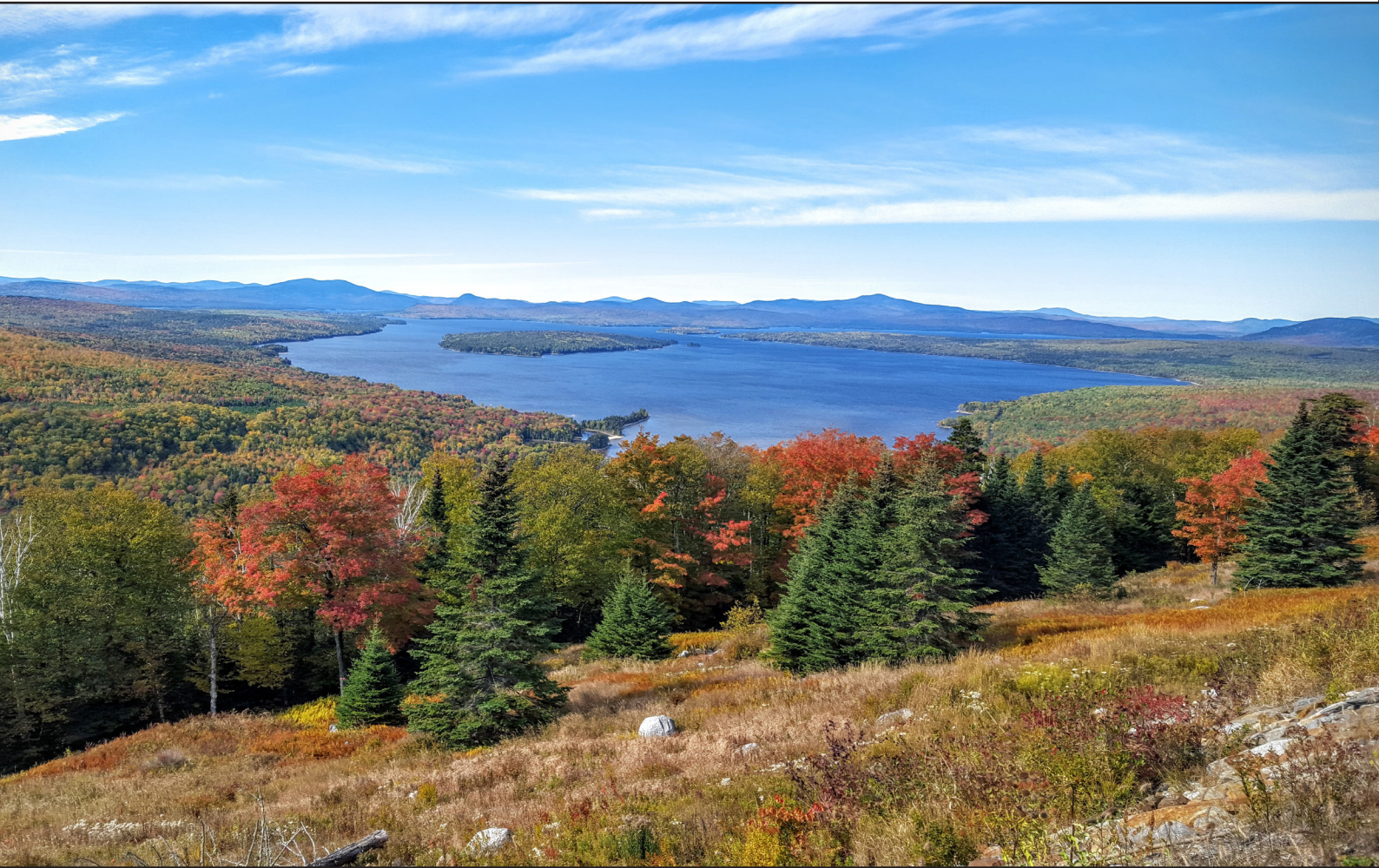
Fall Color near Rangely, Maine. Jared Homola.