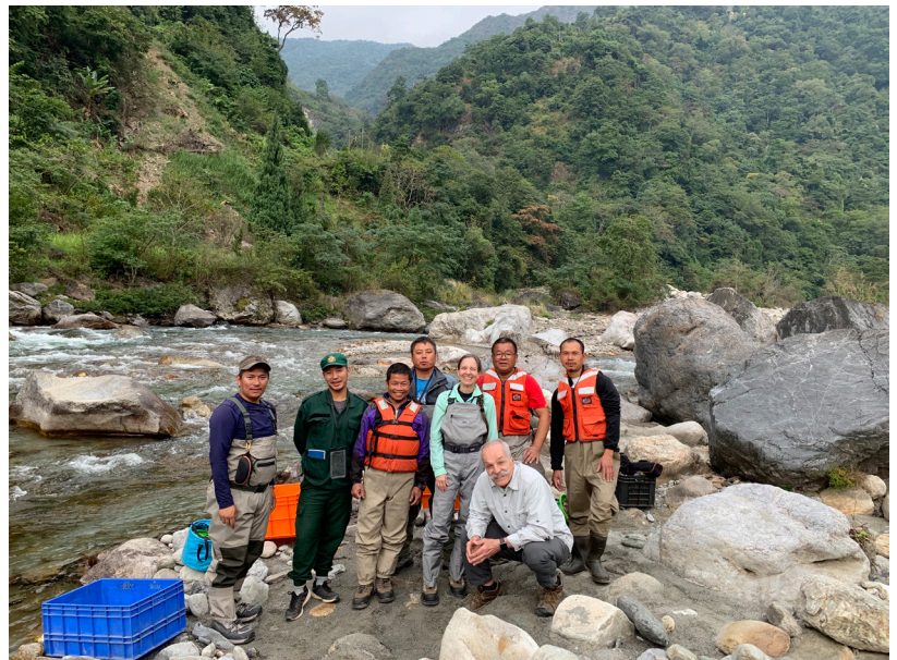
Bhutan December 2019 - field team.