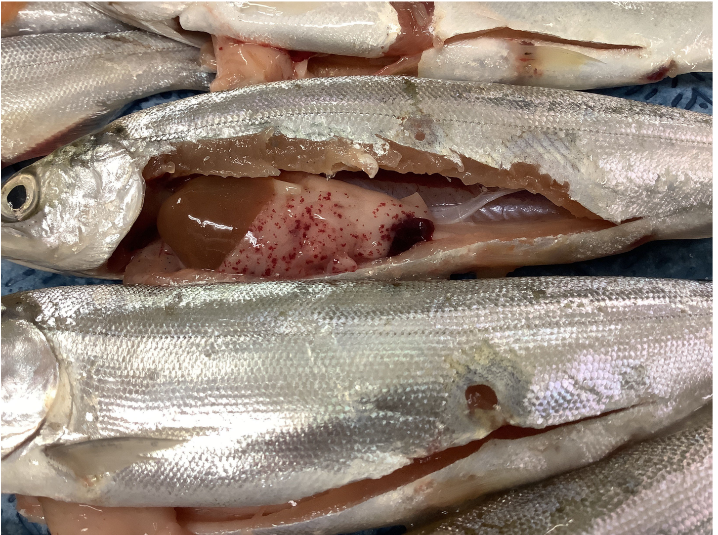
Petechial hemorrhaging indicative of IHNV in juvenile sockeye salmon. Lake Billy Chinook, OR, April 2022.