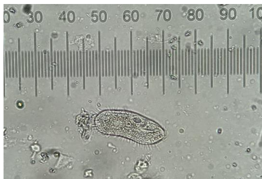
Tetrahymena spp. from skin scrape of an adult summer steelhead, Oct. 2017