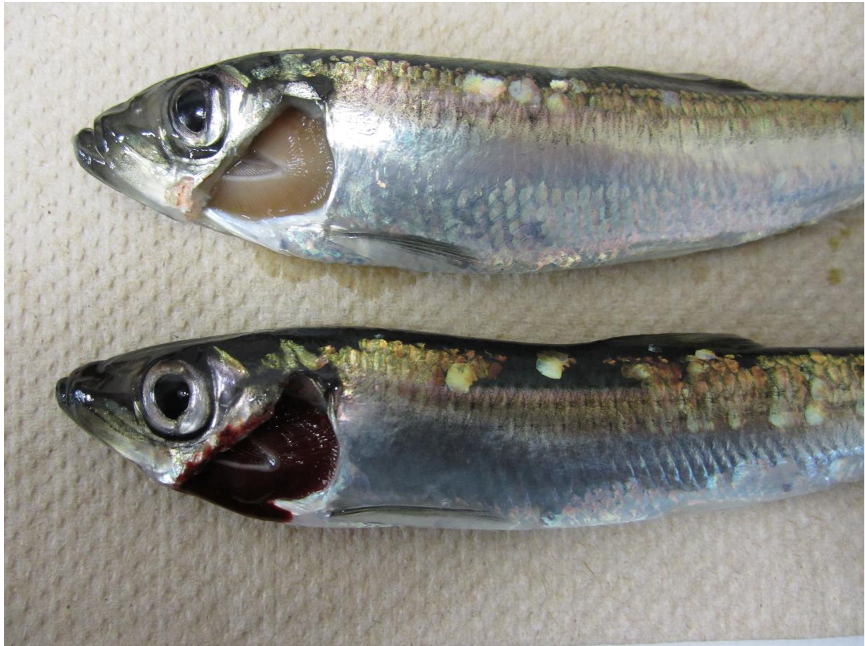
Figure 1. Gills of Pacific herring experimentally infected with ENV (top); note the pale color due to the severe anemia. Bottom fish is an uninfected control.