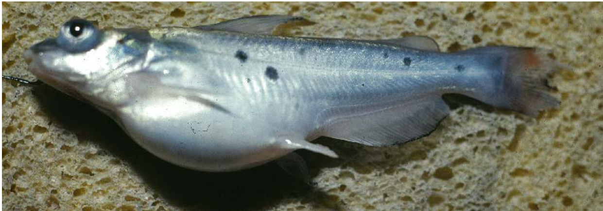
Figure 1. Channel catfish fingerling with abdominal distention and exophthalmia typical of CCV disease.

Histopathology is characterized by an increase in lymphoid cells in the kidney. Renal tubules are necrotic and edematous. Necrosis and edema occur in hematopoietic tissue surrounding the tubules. The liver shows diffuse necrosis, edema, and hemorrhage. Hemorrhage, edema, and possibly mucosal sloughing occur in the intestine. The spleen becomes congested and edematous, and macrophages are laden with degenerated erythrocytes. Cardiac tissue may become necrotic, and focal hemorrhages may occur in the cardiac musculature.